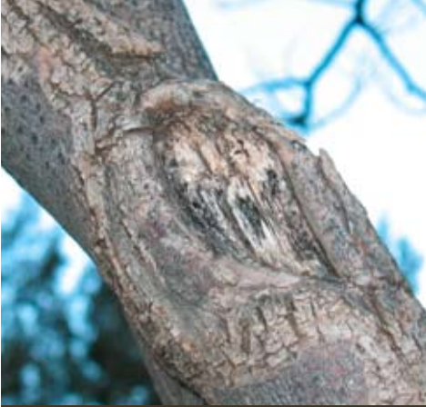
Figure 16. Damaged trunk from pruning too close to the branch collar.