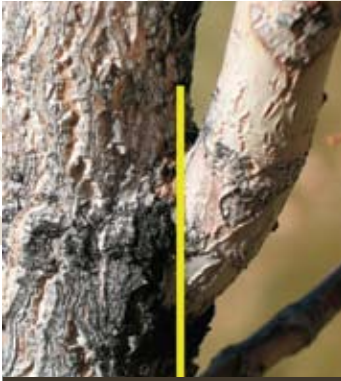
Figure 5. The branch collar surrounds the lighter-colored limb to the right; the yellow line represents where the cut should be made.