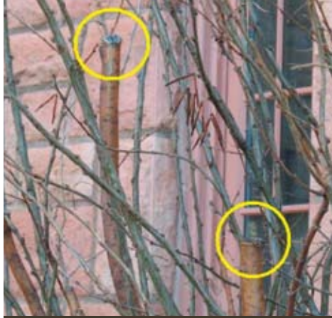
Figure 17. Stubs left from improper cuts on pea shrub ( caragana ).