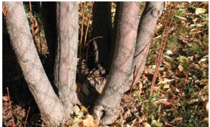
Figure 14. Major suckers at base (left), and smaller suckers beginning to sprout (right).