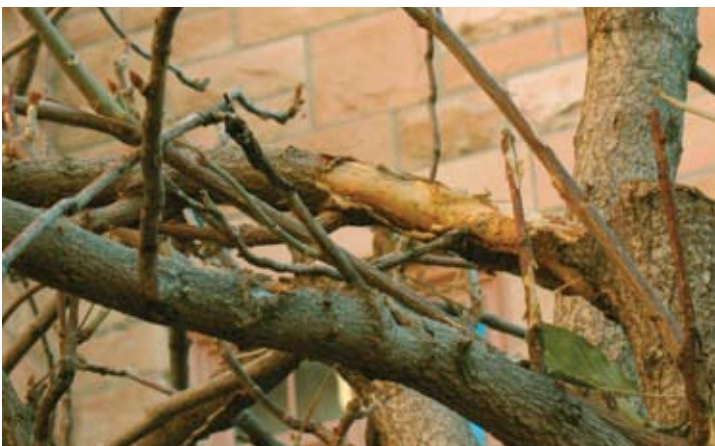
Figure 15. Branch with stripped bark