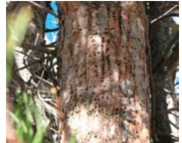
Figure 9. White pine needle scale on spruce (left), gall on spruce (center left), white pine needle scale on ponderosa (center right), and holes from birds digging insects out from trunk (right).