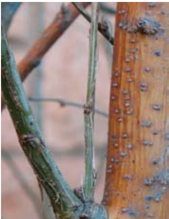
Figure 13. Water sprout growing straight up from limb.