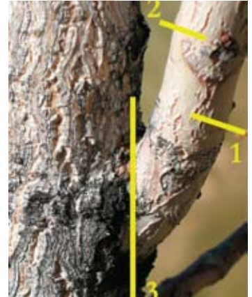
Figure 7. Three-cut method: 1. cut under branch, 2. cut from top of branch, 3. final cut at branch collar.

First, make a cut on the underside of the branch. Second, make a cut on top of the branch, away from the trunk. Third, cut the shorter stub off, making the cut at the branch collar (Figure 7).