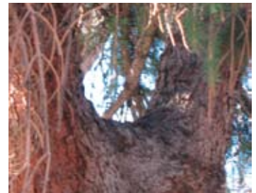
Figure 10. Narrow, weak crotch angle on spruce tree. The branch to the right should have been removed when it was small and initially noticed.