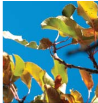
Figure 8. Minor case of fire blight on crabapple.

Consider pruning branches with narrow crotch angles (Figure 10); these result in weak branches, especially during winter storms when snow builds up, adding extra weight.