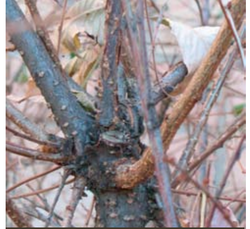
Figure 18. Excess growth resulting from pruning pea shrub.