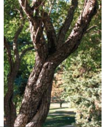
Figure 12. Damage to trunk from smaller rubbing limbs (left); branches that grafted together over time due to rubbing (center and right).